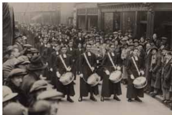
Outside St Nicholas Church, 1936

Latterly, the Direct Grant and the Assisted Places Scheme provided welcome support. These schemes have now ceased and as costs have risen, endowments assist fewer than 10% of our boys. Many OEs and friends of QEH will recognise the value of the education QEH has to offer and are now in a position, themselves, to help other boys benefit.