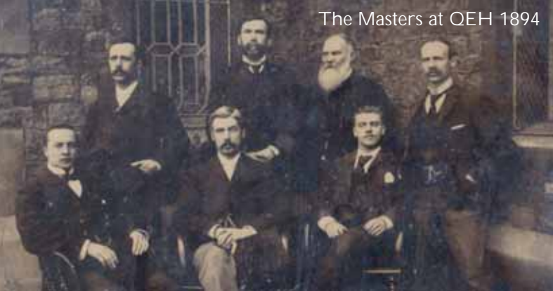
The Masters at QEH 1894