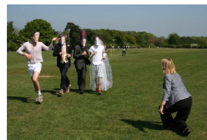
Celebrity runners at the cross-country this year!