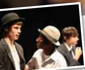
Pictured above: GCSE drama workshop.