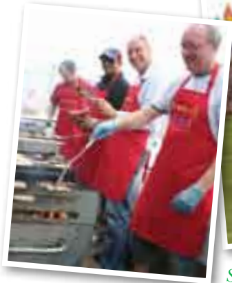
Sports Day activities and Friends' cuisine