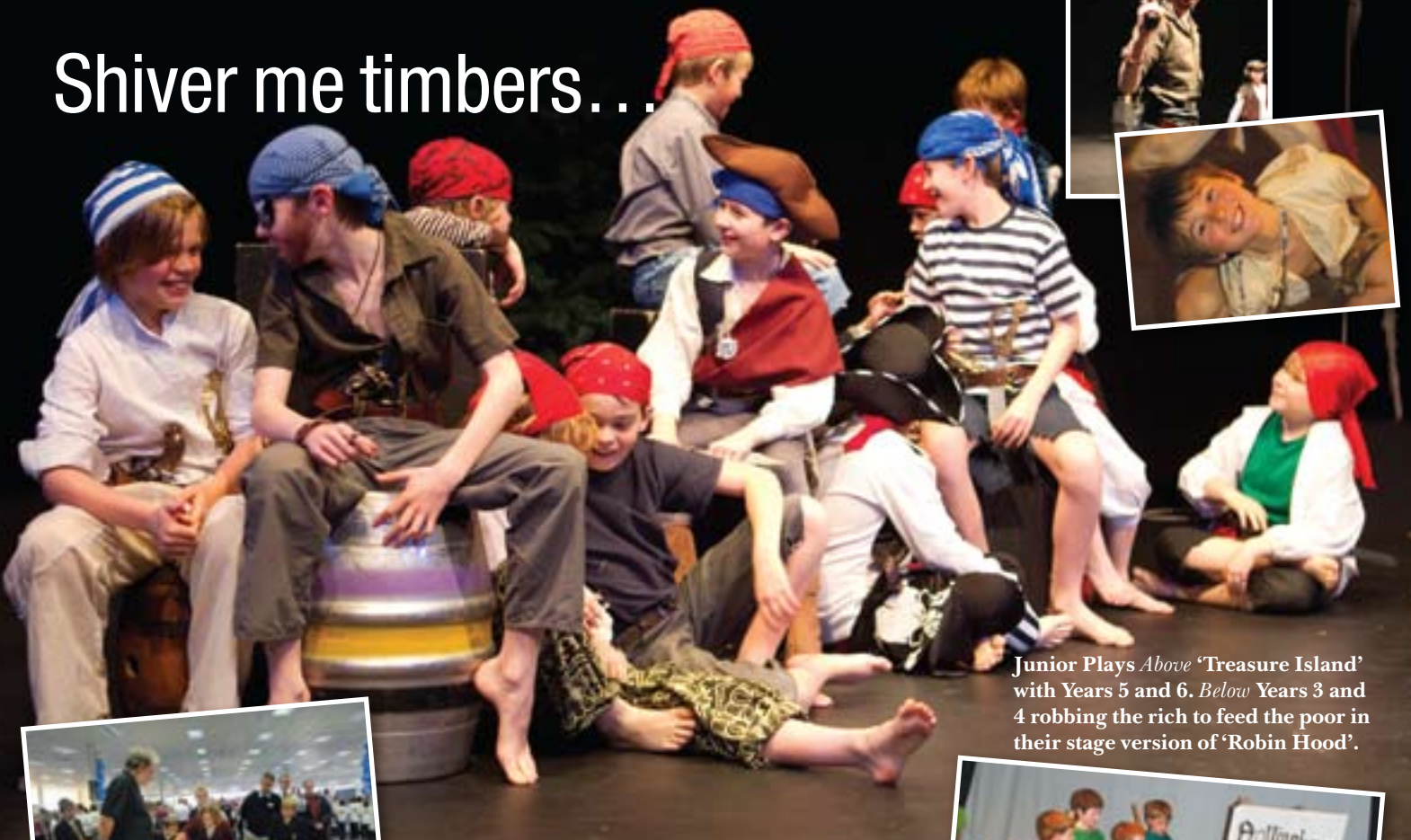
Junior Plays Above 'Treasure Island' with Years 5 and 6. Below Years 3 and 4 robbing the rich to feed the poor in their stage version of 'Robin Hood'.