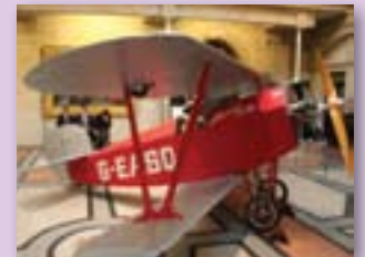
Year 11 physicists had a fascinating visit to the Bristol Museum to view the exhibition: 'Flight: 100 Years of the Bristol Aeroplane Company'.