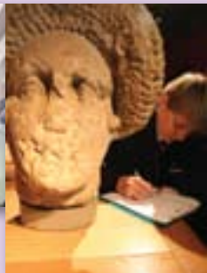
Classics outings included a trip to the Chedworth Roman Villa. A full complement of Year 9 boys headed for Aquae Sulis to see the wonders of the world class museum and steamy baths.