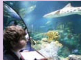
As part of their Enrichment Week, Year 8s enjoyed an excursion to the docks to take in the SS Great Britain and the Aquarium.