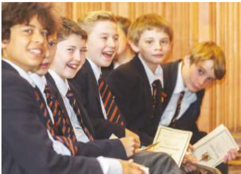
Top left: Mentoring by alumni Top right: House competition trophies Middle left: Solving a maths problem together Middle right: Celebrating success at Prize Giving Bottom: A-level chemistry students